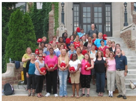
“Show Me How To Play Again” Retreat

A new report from the American Academy of Pediatrics (AAP) says free and unstructured play is healthy and - in fact - essential for helping children reach important social, emotional, and cognitive developmental milestones as well as helping them manage stress and become resilient.